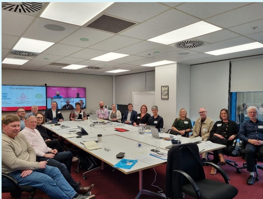
September peak bodies meeting at NZQA

The minutes from the Cross-agency peak bodies meeting can be found in the Members area of the website .